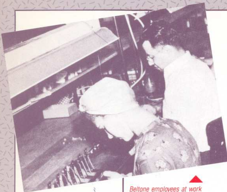
Beltone employees at work

in the war in bomb proximity fuses, is to be released for use by American industry. The printed circuit replaces a mass of soldered wires. Hearing Aid magazine premieres.